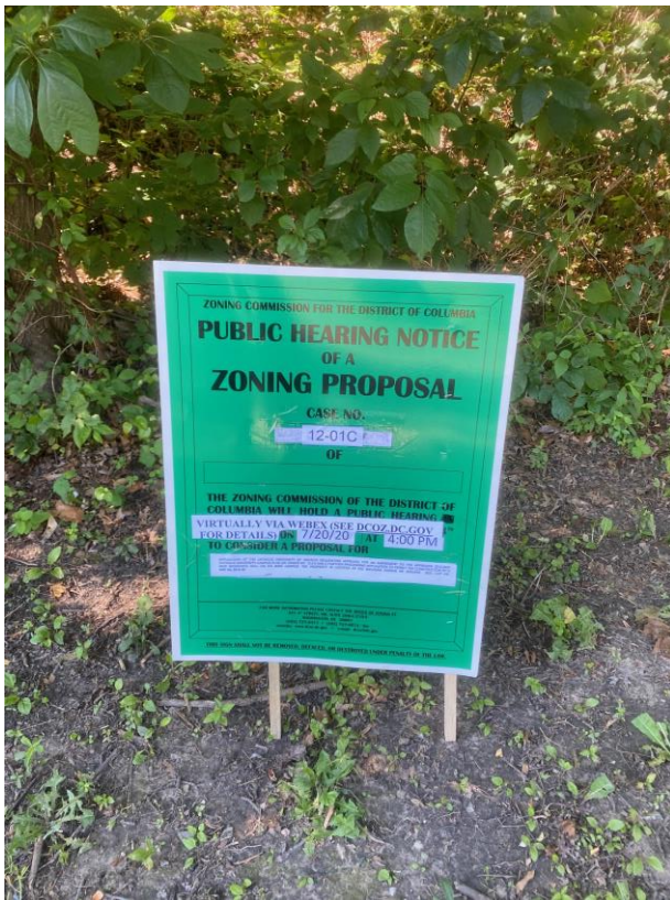
3. 6/8/20 Taylor Street NE