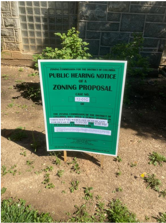
1. 6/8/20 Michigan Avenue NE