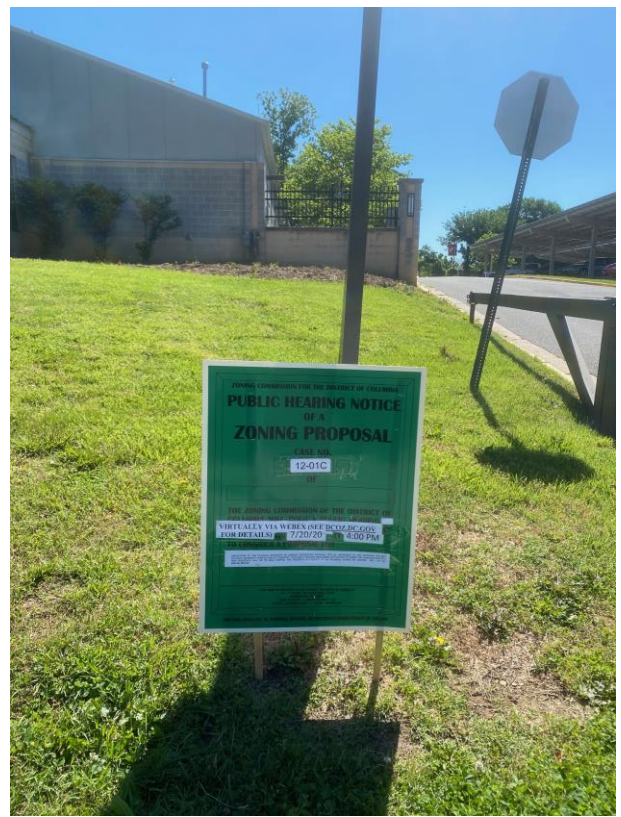
4. 6/8/20 Harewood Road NE